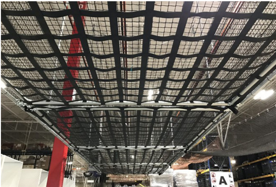
Stacked WebNet™ as Horizontal Conveyor Guard