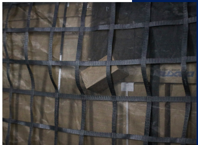
Shown with optional debris liner.