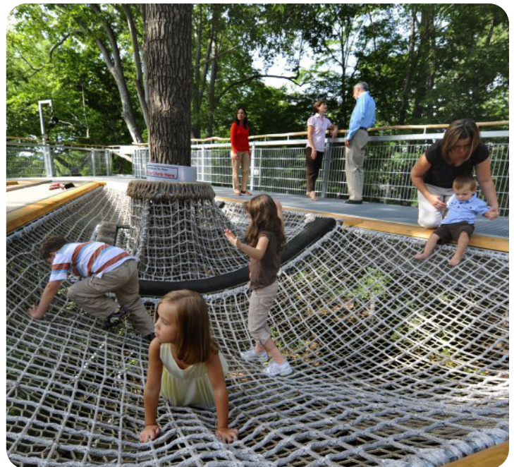
Loft and Lounge Nets

InCord produces high quality rope and netting products that may be integrated seamlessly into your project. Multiple material and color options are available to ensure the look you want without compromising safety and durability.