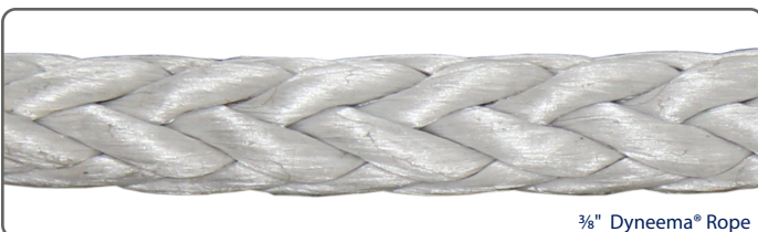
3/8" Dyneema® Rope

Custom designed with your safety as our top priority, our materials are rigorously tested to exceed industry standards.